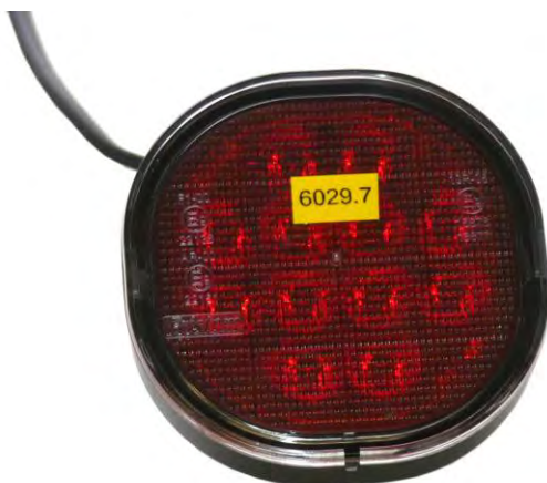
Photography 1: Sample 6029.7 – LED Lamp type FT-400 (to be tested on IP6X)