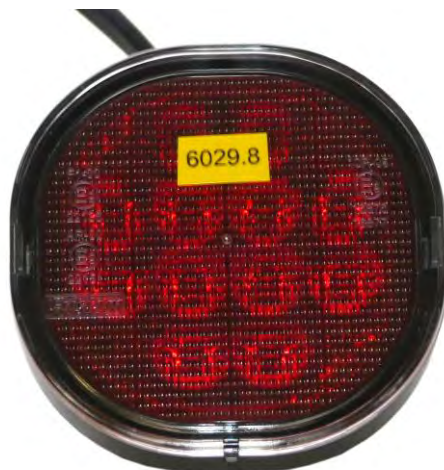
Photography 2: Sample 6029.8 – LED Lamp type FT-400 (to be tested on IPX8)