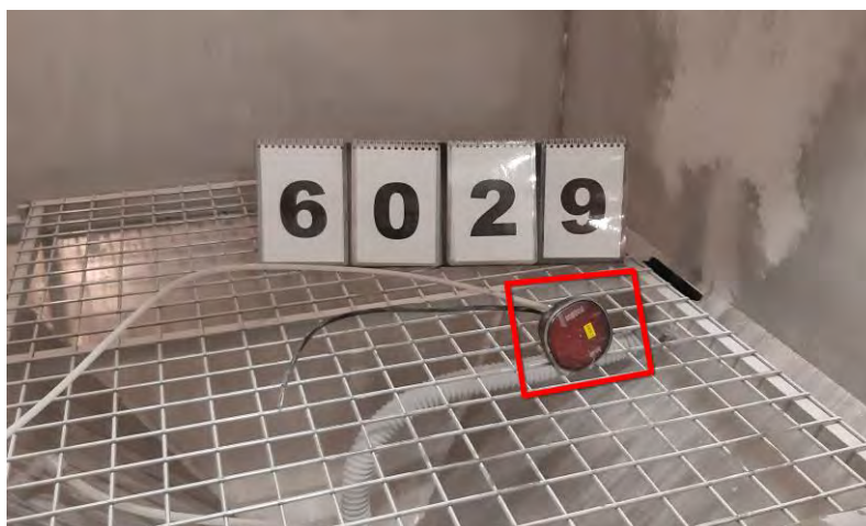
Photography 3: Sample 6029.7 – LED Lamp type FT-400 (marked with red line) during the IP6X test